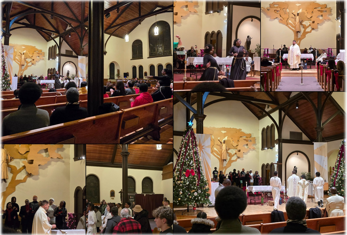
↑ ST. MARTIN DE PORRES: CHRISTMAS EVE ↑ AND ↓ ST. MICHAEL: CHRISTMAS DAY ↓