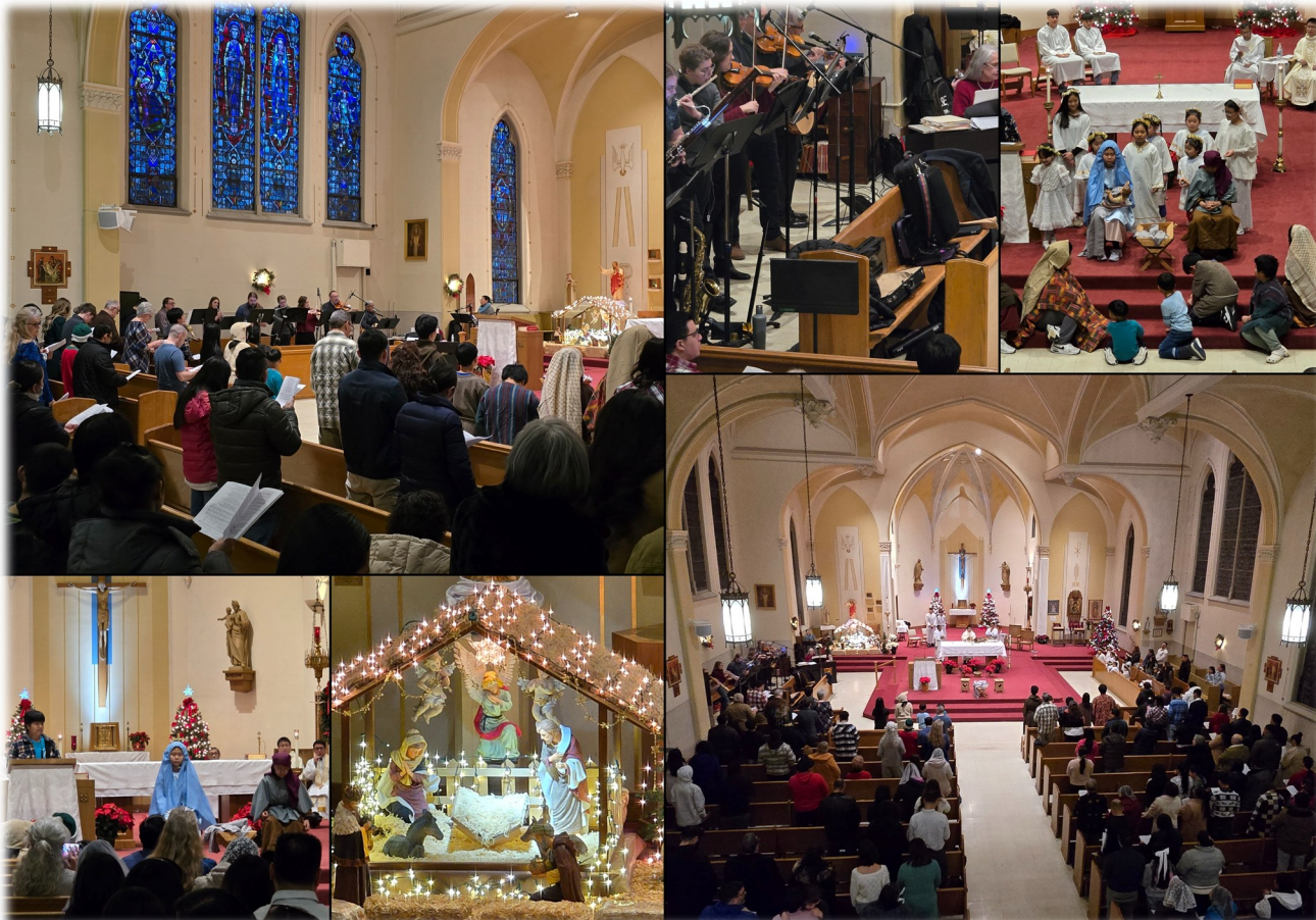
↑ ST. ROSE: CHRISTMAS EVE ↑ AND ↓ ALL SAINTS: CHRISTMAS EVE ↓