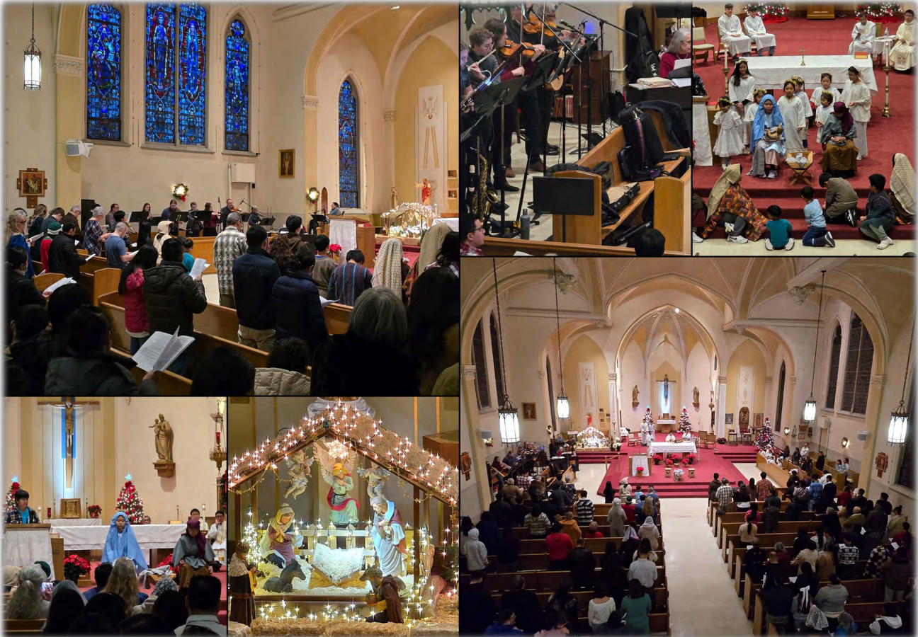
↑ ST. ROSE: CHRISTMAS EVE ↑ AND ↓ ALL SAINTS: CHRISTMAS EVE ↓