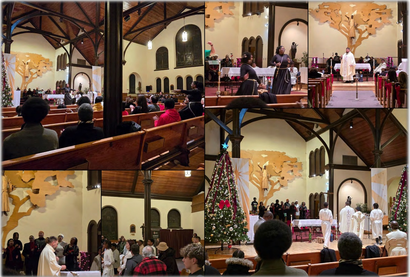
↑ ST. MARTIN DE PORRES: CHRISTMAS EVE ↑ AND ↓ ST. MICHAEL: CHRISTMAS DAY ↓