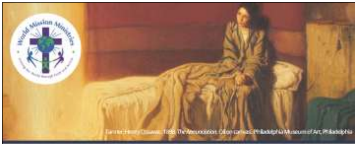
Philippe de Champaigne, 1688, The Visitation, Collection of the Philadelphia Museum of Art, Philadelphia